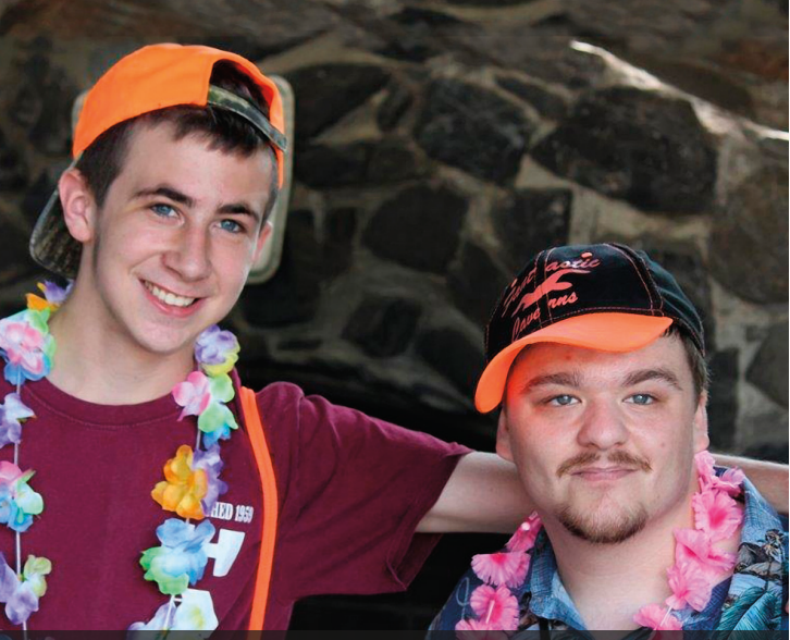
Shared living residential support services for adults